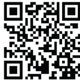
360° view of Gambang Halal Park

GET IN TOUCH WITH US FOR EXCITING INVESTMENT OPPORTUNITIES IN ECER MALAYSIA