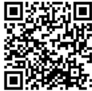
360° view of Kerteh Biopolymer Park

GET IN TOUCH WITH US FOR EXCITING INVESTMENT OPPORTUNITIES IN ECER MALAYSIA