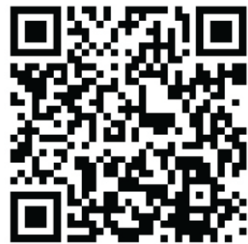
360° view of Pekan Automotive Park

GET IN TOUCH WITH US FOR EXCITING INVESTMENT OPPORTUNITIES IN ECER MALAYSIA